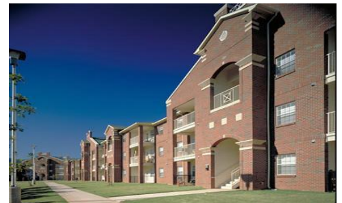
On Campus housing

For information about other hotels in and around Stillwater please visit http://iss.okstate.edu/housing